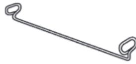
2 x Wire Spacer