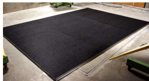
Test specimen arranged for test