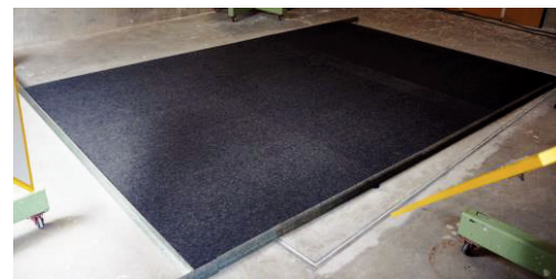
Test specimen arranged for test