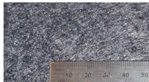
Close up view of specimen face and edge