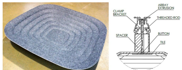
Left: Oblique view of the Woven Image 'Fuji 9 x 9 ceiling tile'; Right: Fuji plastic mount