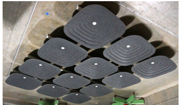
Specimen as tested (image inverted to depict ceiling installation)