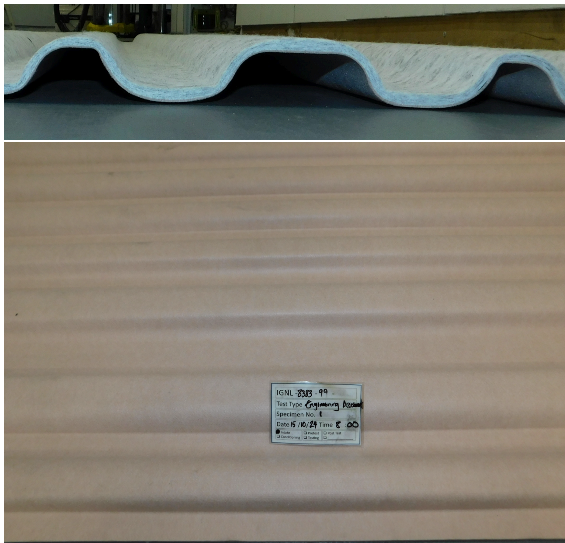
CURTAIN WALL PANELS

While an increase in surface area is correlated with a worse performance of the material, it was observed through testing of the Column material that flashover occurred at the end of the time period that signals a Group 2 result, reaching flashover 9.5 minutes after the threshold for a Group 3 result. Based on the increase of 2.3% in lineal surface area and on the performance of the Column material being 30 shy of a Group 1 status, the difference in profile is not deemed to be substantial enough to change the Group number classification. The composition, thickness, and density of the panels is to remain identical.