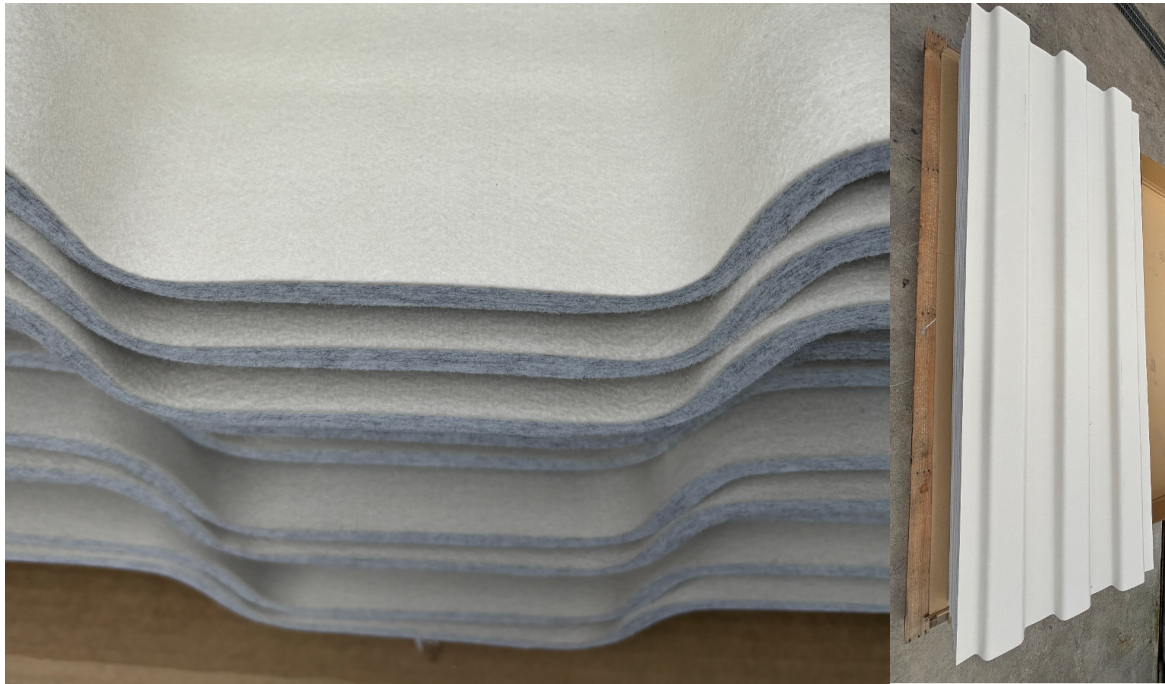
FIGURE 1: COLUMN WALL PANELS

The Column wall lining panels achieved the following Group Number and SMOGRA values, with flashover occurring 1170 seconds into the test.