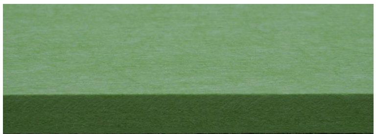
Close-up showing face and cut edge of panel (edge covered by steel skirt during test)