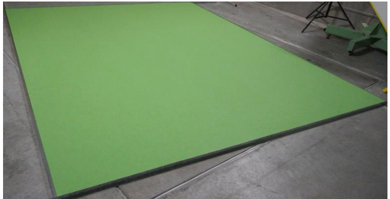
Test specimen installed for testing