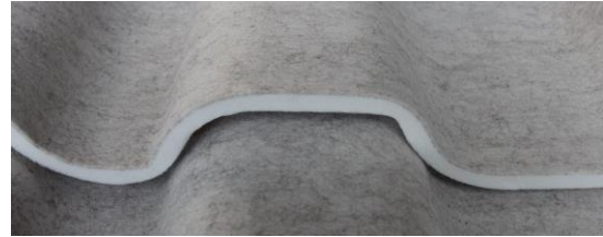
Detailed view of test specimen.