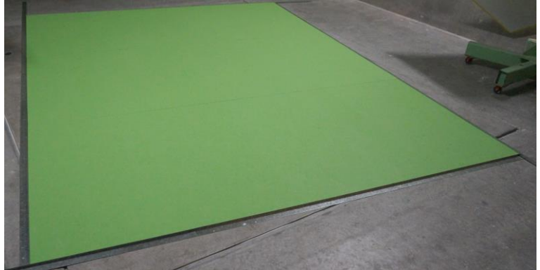
Test specimen installed for testing