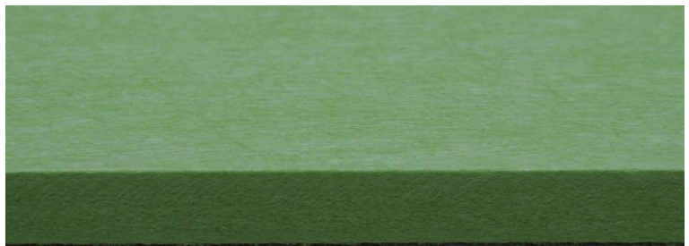
Close-up showing face and cut edge of panel (edge covered by steel skirt during test)