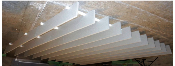
Specimen as tested (image inverted to depict ceiling installation)