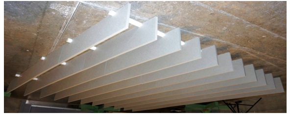
Specimen as tested (image inverted to depict ceiling installation)