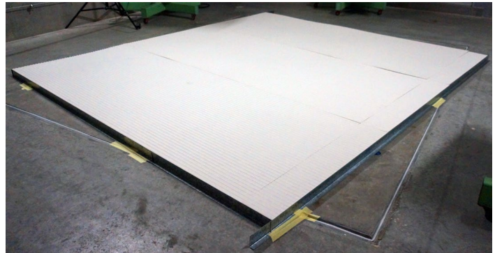
Test specimen installed in laboratory for testing