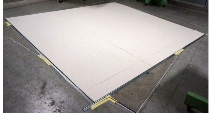
Test specimen installed in laboratory for testing