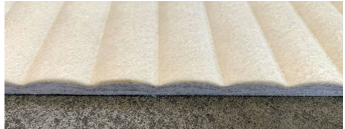
Detail of side and front of Panel.