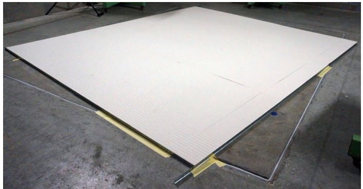
Test specimen installed in laboratory for testing