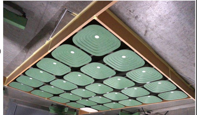
Specimen as tested (image inverted to depict ceiling installation)