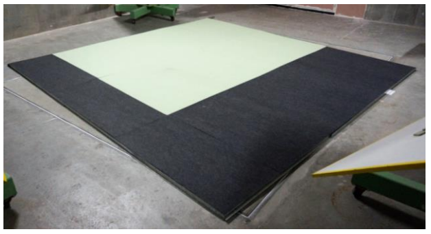
Test specimen installed in laboratory