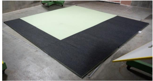
Test specimen installed in laboratory