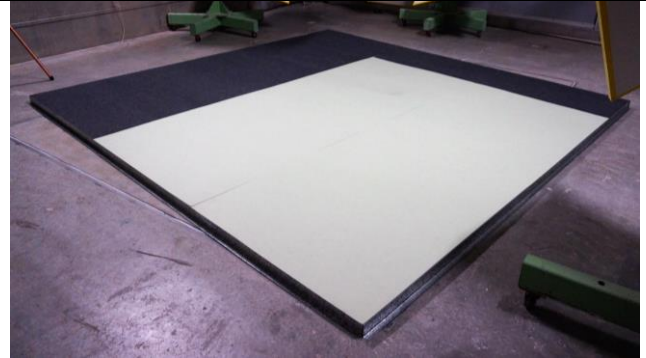
Test specimen installed in laboratory