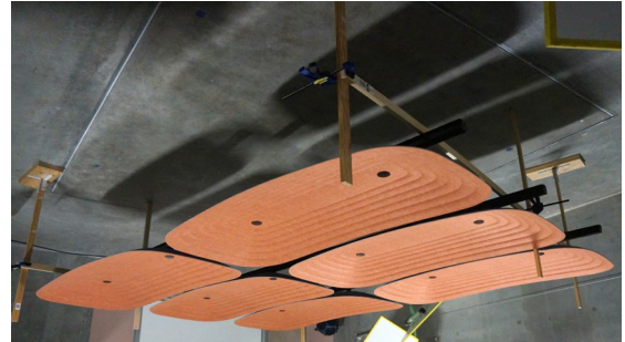
Specimen as tested (image inverted to depict ceiling installation)

Test Specimen Details 3 : Product designation: Woven Image 'Fuji Hachi 9 x 12 ceiling tile' 'Fuji Hachi 9 x 12 ceiling tile' composition: 3 mm thick non-woven PET core (70% recycled) with a 1.3 mm thick 'Mura' (100% PET - 60% recycled) layer laminated to front and rear faces compressed to 4.6 mm (± 2 mm) and thermoformed into a dished profile resulting in a rounded rectangle absorber tile 1740 x 840 mm (± 3 mm) x 132 mm deep. Tile weight: 2570 g ea (meas); Area density (Tile only): 1740 gsm (nom). Supplied with proprietary mounting/installation kits comprising: - a) Mounting Rails (2.5 m long proprietary aluminium extrusions to be fixed to or suspended from the ceiling above), b) joiners to join mounting rails/segments together, c) Barrel kit mounts (made from ABS/stainless steel) to fix tiles to rails, d) mounting rail end caps, e) snap covers (cut to size to close-off the open mouth of the mounting rails).