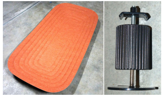
Left: Oblique view of the Woven Image 'Fuji Hachi 9 x 12 ceiling tile'; Right: Fuji Barrel kit mount

Installation: (carried out by laboratory staff, as per manufacturer's instructions) The reverberation chamber was swept and vacuumed. Due to test-laboratory constraints, this product was tested upside-down on the floor of the test chamber in a manner acoustically equivalent to being suspended below the ceiling of a normal room. The specimen for testing consisted of mounting rails positioned in 3 parallel lines at 900 mm centres, with 2 tiles per line (2 Barrel kit mounts per tile; 900 mm centres). End caps and snap covers were used to close-off the voids of the rails as per a field installation. Tiles installed to present concave dish face visible to the test chamber. To replicate an in-situ 300 mm suspended tile installation, the tiles installed on the rails were clamped to a timber frame with 300 mm from the bottom of the tile to the floor of the test chamber; the rectangular 2 x 3 array of tiles was oriented at an angle of 13° from the walls of the chamber (not parallel, as per AS ISO 354 cl 6.2.1.2), and was notionally applying acoustic treatment to an area 5 of 3600 x 2700 mm. The specimen area of 9.72 m 2 is less than 10 - 12 m 2 required for compliance with AS ISO 354; partial rows, non-rectangular test specimen shape or cutting tiles deemed to be greater deviation from the requirements in AS ISO 354 and/or manufacturers' field installation recommendations. The perimeter edges of the test specimen were not enclosed 6 .