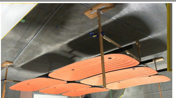
Specimen as tested (image inverted to depict ceiling installation)