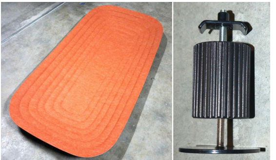
Left: Oblique view of the Woven Image 'Fuji Hachi 9 x 12 ceiling tile'; Right: Fuji Barrel kit mount