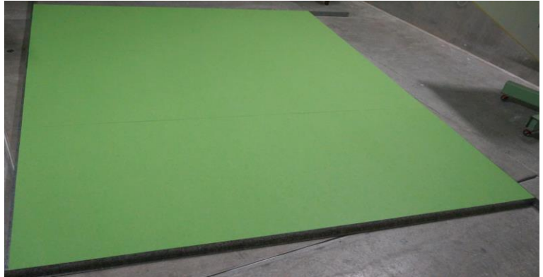
Test specimen installed for testing