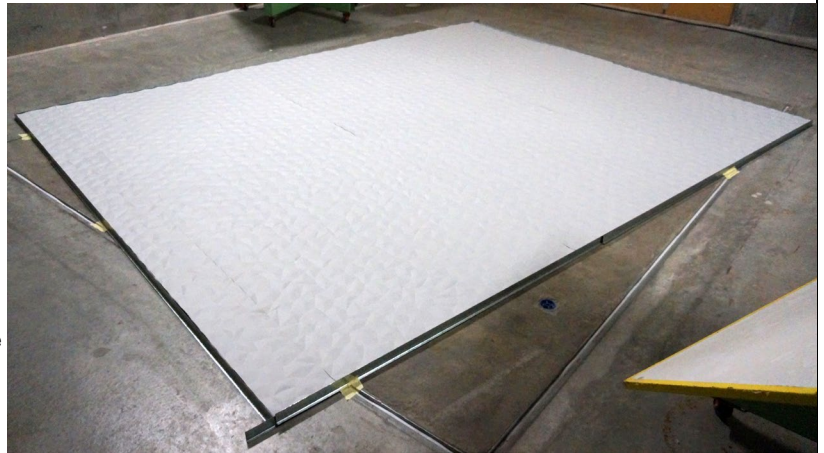
Test specimen installed for testing