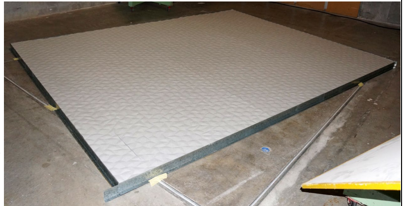
Test specimen installed for testing