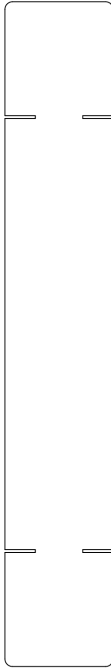
Paling B 285 x 1750mm