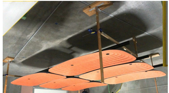
Specimen as tested (image inverted to depict ceiling installation)