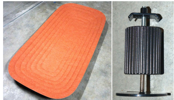
Left: Oblique view of the Woven Image 'Fuji Hachi 9 x 12 ceiling tile'; Right: Fuji Barrel kit mount