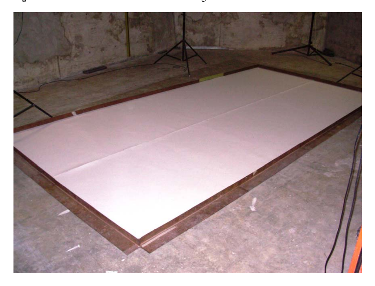
Figure 1: 2mm EchoPanel Wall installed for testing in the Reverberation Chamber.

Figure 1 depicts the sample installed in the chamber for testing.