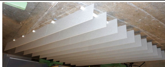
Specimen as tested (image inverted to depict ceiling installation)