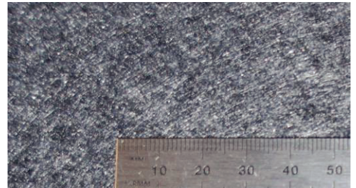
Close up view of specimen face and edge