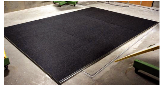
Test specimen arranged for test