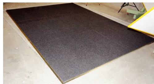
Test specimen arranged for test