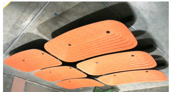
Specimen as tested (image inverted to depict ceiling installation)