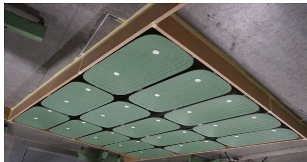
Specimen as tested (image inverted to depict ceiling installation)