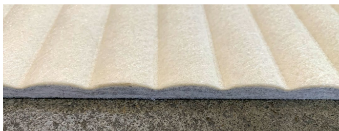
Detail of side and front of Panel.